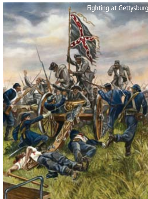
Fighting at Gettysburg

The 'Gettysburg Address': There was terrible fighting at Gettysburg, Pennsylvania, during the Civil War. After the war, Lincoln made a famous speech there. The dead did not die for nothing, he said. They died for people to be free.