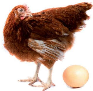
lay an egg (v)