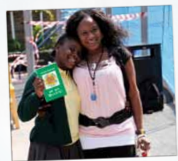
Me, mum and my book