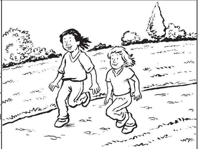
Playing in the park.