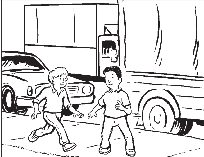
Playing in the street amongst traffic.