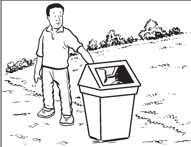
Putting litter in the bin.