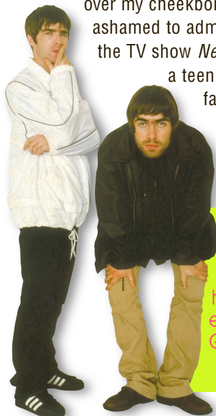
“I even grew my hair over my ears like Liam Gallagher.”

I even grew my hair over my ears like Noel and Liam Gallagher and curled it over my cheekbones! I'm ashamed to admit that I liked the TV show Neighbours as a teen and that my favourite Spice Girl was Posh Spice!