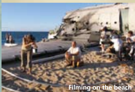
Filming on the beach