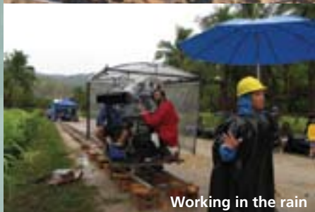
Working in the rain