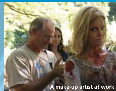
A make-up artist at work

The crew are the people who work for the directors and the producers behind the scenes. They include the people who work the sound, lighting and cameras and the make-up artists.