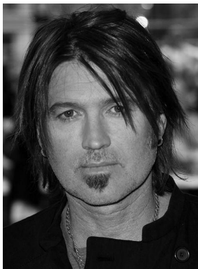
a. Billy Ray Cyrus