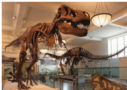
Inside the Dinosaur Halls

famous things you can see is a very big blue whale. It is more than 28 metres long! Also, the Dinosaur Halls are fantastic. They have more than a million things to see there.