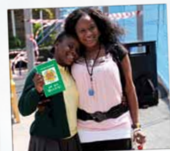
Me, mum and my book