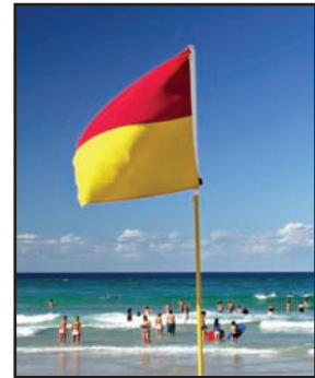
red and yellow flag