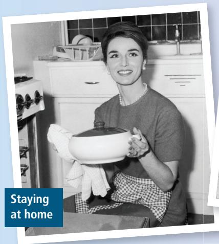
Staying at home

In the 1950s, women usually had to make a choice between getting married and having a career. Jenny's mother doesn't go to work, she stays at home. Miss Stubbs and Miss Walters have good jobs, but they are unmarried. Jenny's father obviously thinks a good marriage is more important than a university education. Despite spending