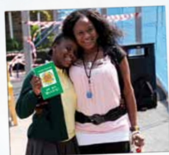
Me, mum and my book