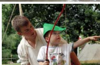
The Robin Hood Fair, Nottingham

The outlaw of Sherwood Forest is as popular today as he was six hundred years ago. Every year, in Nottingham, there is a big Robin Hood fair. There are also many films and TV shows about him.