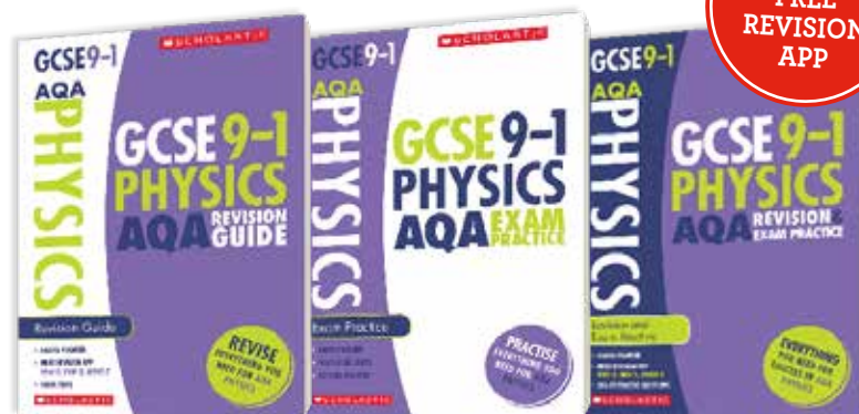
ISBN 9781407176758 Physics Revision Guide for AQA