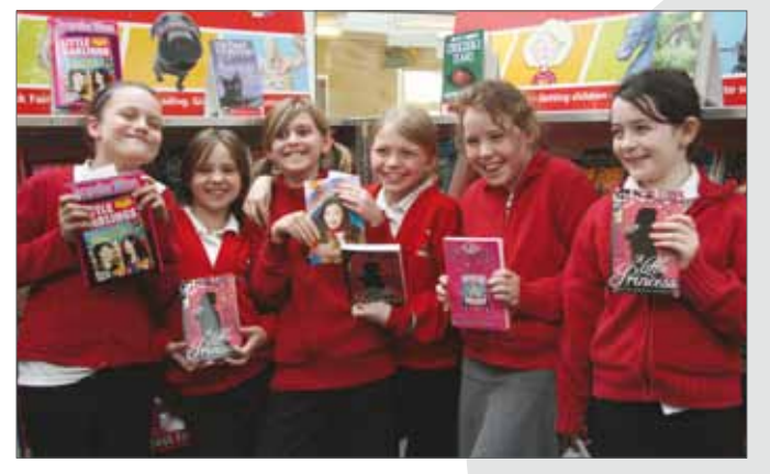
• We offer age-ranged bookcases to suit all schools' needs