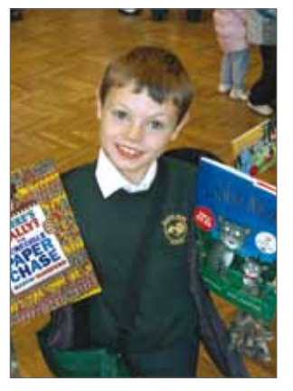
• We deliver a compact mobile bookshop to your school for a week, for free