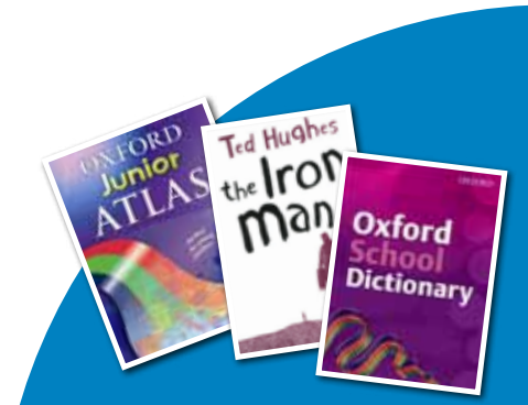
• We offer a variety of commission options to match schools' different needs

Over 1400 titles to choose from at commissionshop.scholastic.co.uk