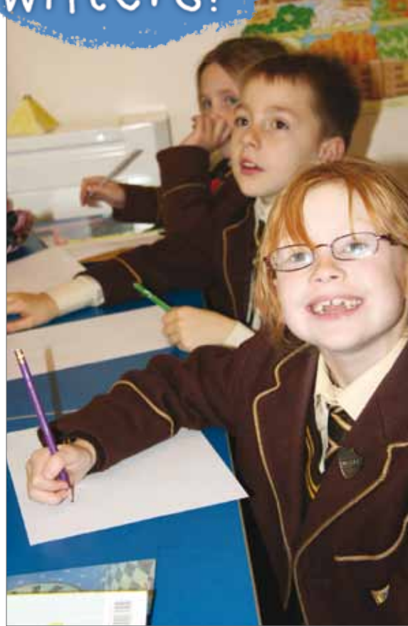
• Every child can become a published author in your school's very own book with We Are Writers *

• We are the only Book Fair supplier to offer We Are Writers, a unique literacy building project that's free to take part