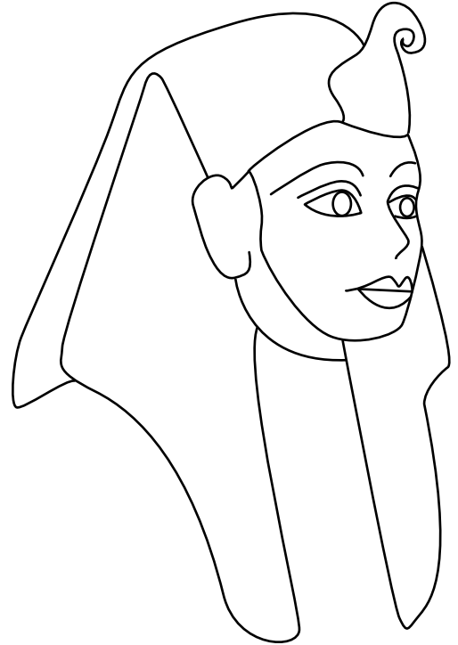
a) P _ _ _ _ H

The Ancient Egyptians lived about 5,000 years ago. Their kings were called Pharaohs. The Pyramids are the stone tombs of the Pharaohs. The Pyramids are near the river Nile. The Pharaohs put their gold in the pyramids. The Great Pyramid is the biggest. It is 140m high. The Sphinx is in front of all the pyramids. It has the body of a lion and the head of a pharaoh.