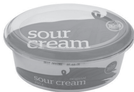
tub of sour cream