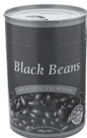
can of black beans