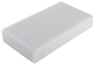
block of cheese