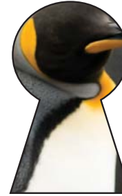
a) penguin .....